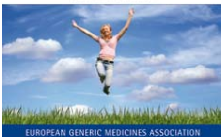
EUROPEAN GENERIC MEDICINES ASSOCIATION