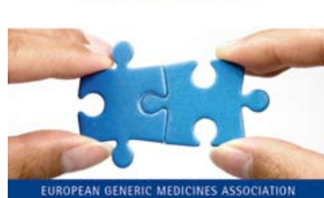
EUROPEAN GENERIC MEDICINES ASSOCIATION