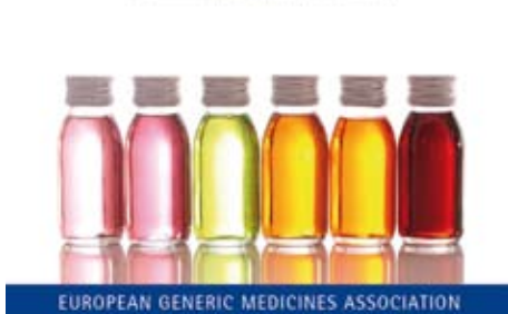
EUROPEAN GENERIC MEDICINES ASSOCIATION