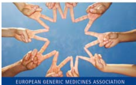
EUROPEAN GENERIC MEDICINES ASSOCIATION