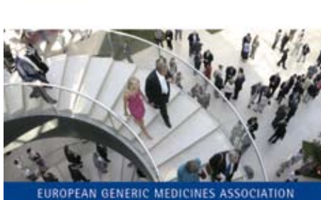
EUROPEAN GENERIC MEDICINES ASSOCIATION